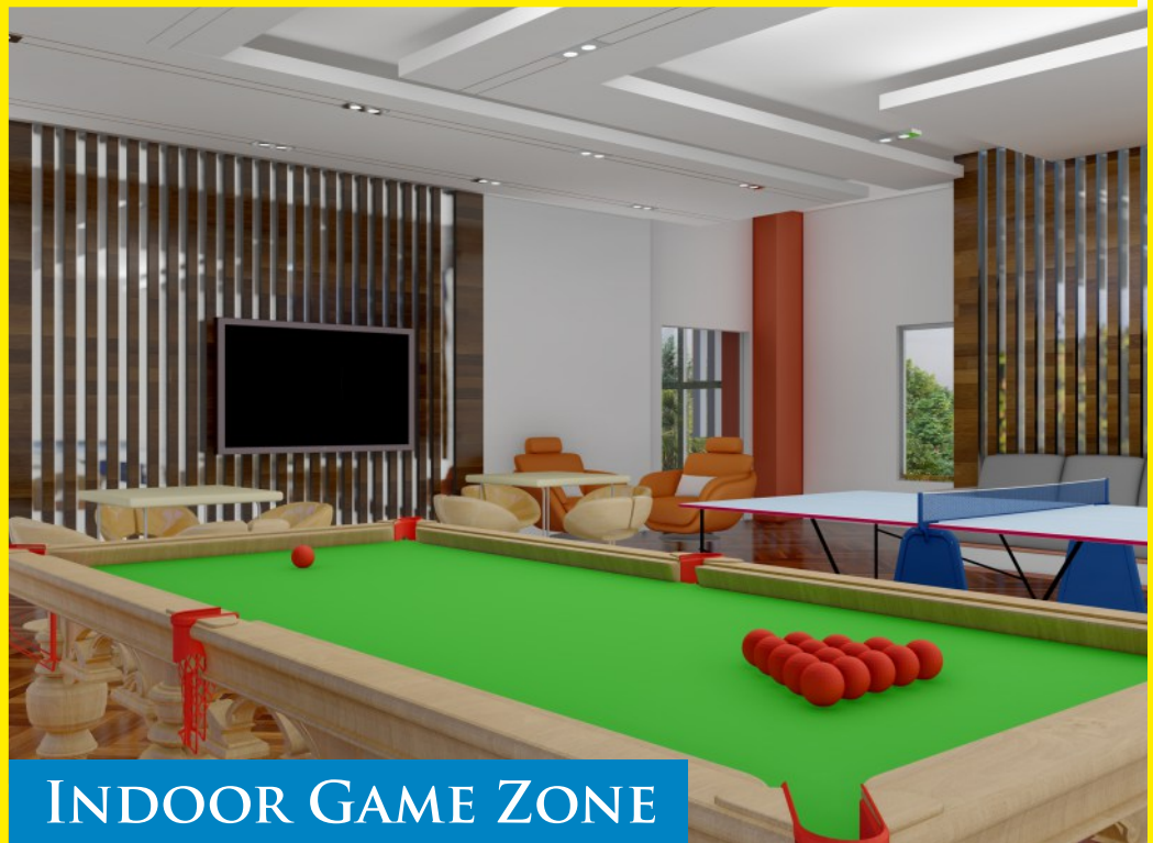
INDOOR GAME ZONE