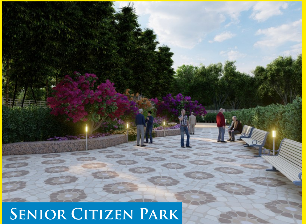
SENIOR CITIZEN PARK